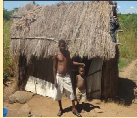
Left with Nothing! Crops destroyed, this young man has been left to care for his little nephew

HEAVY RAINS BROUGHT DEVASTATION TO THE SOUTHERN REGION OF MALAWI EARLY THIS YEAR. THOUSANDS OF HOUSES COLLAPSED IN THE FLOODS AND THE YEAR'S HARVEST WAS SWEEPED AWAY. WE HEARD REPORTS THAT ENTIRE VILLAGES HAD BEEN ENGULFED AND MANY LIVES WERE LOST. ABOVE ARE JUST TWO OF THE MANY FLOOD VICTIMS WHO HAVE MADE SHELTERS FROM BRANCHES, GRASS AND OLD SACKS.