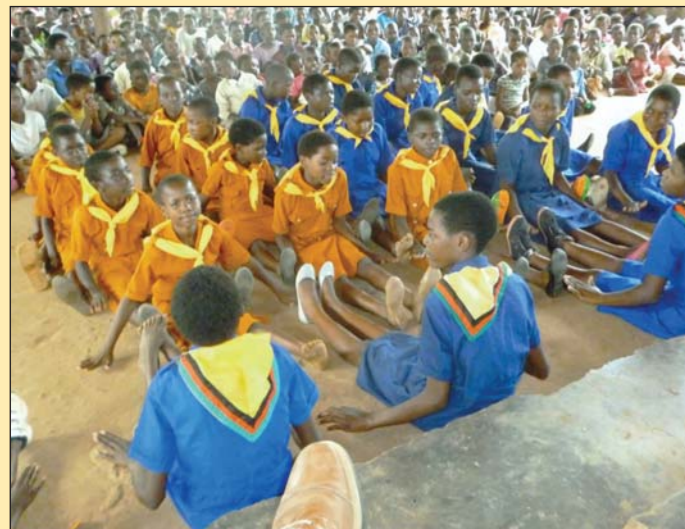
Our Girl Guides and Brownies give our orphan children a display during a presentation at Namisu

CONGRATULATIONS TO THE MANY NEEDY STUDENTS IN OUR CARE WHO HAVE BEGUN VARIOUS PROFESSIONAL COURSES IN VOCATIONAL TRAINING THIS YEAR INCLUDING THOSE WHO ARE TO BEGIN DEGREE COURSES AT CHANCELLOR COLLEGE, UNIVERSITY OF MALAWI.