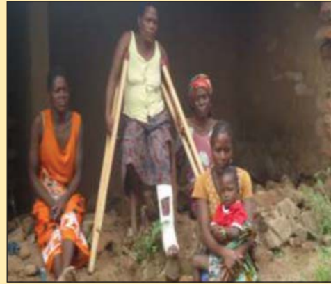
This elderly widow's house collapsed around her at night, breaking her leg.