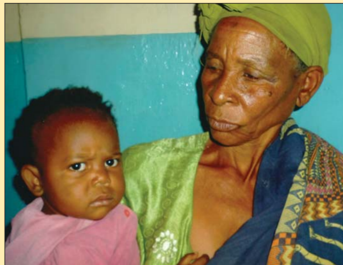
One of more than 100 Grannies who bring orphan babies for food, clothing, soap, care and medical care each month