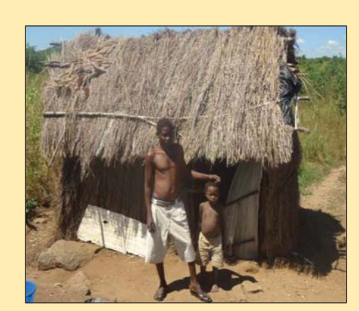
Left with Nothing! Crops destroyed, this young man has been left to care for his little nephew

HEAVY RAINS BROUGHT DEVASTATION TO THE SOUTHERN REGION OF MALAWI EARLY THIS YEAR. THOUSANDS OF HOUSES COLLAPSED IN THE FLOODS AND THE YEAR'S HARVEST WAS SWEPT AWAY. WE HEARD REPORTS THAT ENTIRE VILLAGES HAD BEEN ENGULFED AND MANY LIVES WERE LOST. ABOVE ARE JUST TWO OF THE MANY FLOOD VICTIMS WHO HAVE MADE SHELTERS FROM BRANCHES, GRASS AND OLD SACKS.