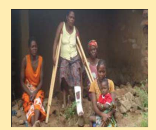
This elderly widow's house collapsed around her at night, breaking her leg.