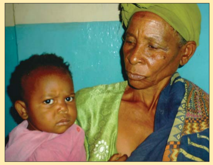
One of more than 100 Grannies who bring orphan babies for food, clothing, soap, carex and medical care each month