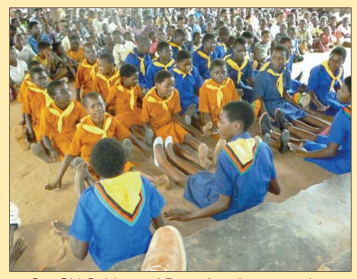
Our Girl Guides and Brownies give our orphan children a display during a presentation at Namisu

CONGRATULATIONS TO THE MANY NEEDY STUDENTS IN OUR CARE WHO HAVE BEGUN VARIOUS PROFESSIONAL COURSES IN VOCATIONAL TRAINING THIS YEAR INCLUDING THOSE WHO ARE TO BEGIN DEGREE COURSES AT CHANCELLOR COLLEGE, UNIVERSITY OF MALAWI.