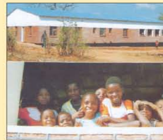
□ With Love from Wisconsin USA!

Our centre at Funsani where 22 resident and 160 daycare orphans are funded and nurtured by Springlake Church, Green Bay, Wisconsin.