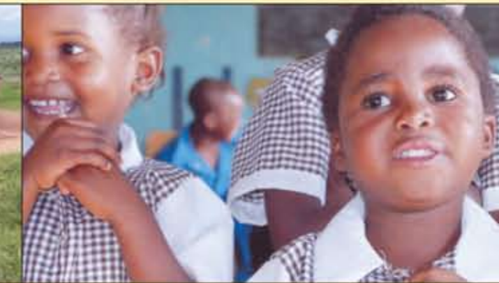
□ Glowing with health! Children from our orphan centre at Thyolo, a testimony to the love and generosity of St Andrews Church members and friends in Arbroath. 140 daycare and 24 resident children enjoy Scottish hospitality at Thyolo!