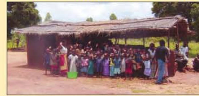
□ The ruined shelter where 54 orphans were being cared for by a group of gallant local volunteers with minimal resources.....