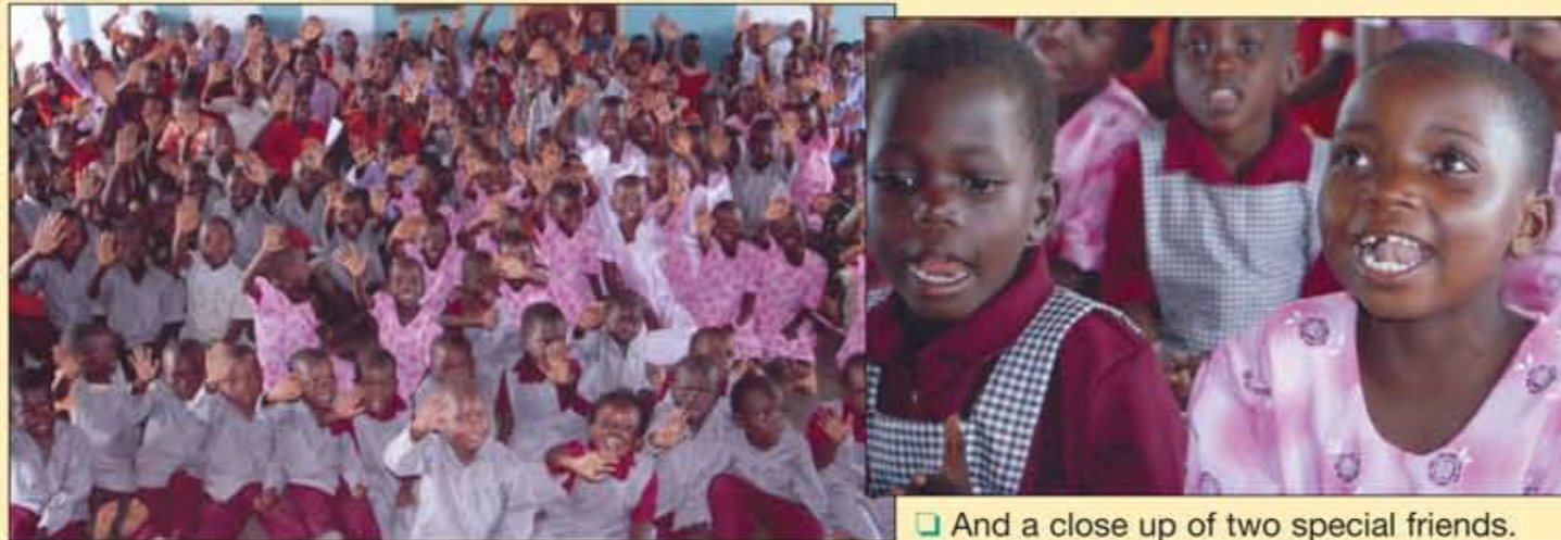
□ An enthusiastic welcome from some of the 175 children at our Bethel Orphan Centre in the Phalombe district of Malawi, just one of Aquaid Lifeline's 13 centres in the warm heart of Africa.