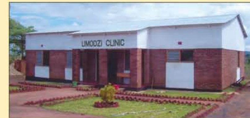
□ Umodzi Clinic serves a needy and remote area at Namaritha, East Zomba. Aquaid Lifeline cares for 400 children at this project. The clinic and the primary school on this site were funded entirely by a Cambridge agency. City Stay continues to support Umodzi, for which we are grateful.

Members of Spring Lake make regular visits to Funsani with medical supplies and clinical expertise.