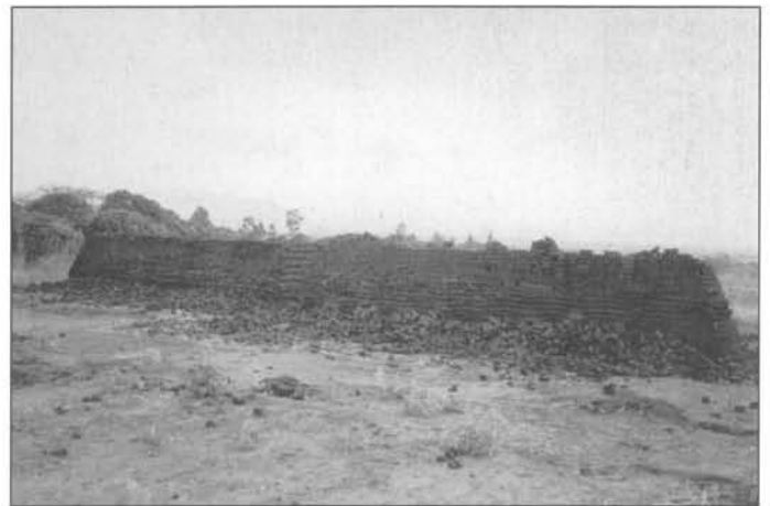
Two of the eight kilns of 50,000 bricks each made individually by hand at Namisu

A young brickmaker, overcome by fatigue, relaxes with dad at sundown as the grown ups review the day's work and plan for tomorrow.