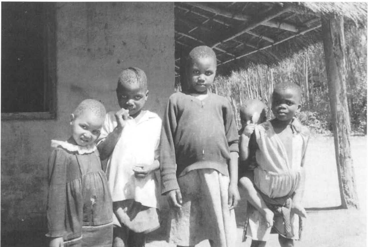
Children of the Ntorowa Region, close to the Mozambique border. The little girl on the right is aged 7, but she already bears the burden of responsibility for her brother, since they have lost both parents.

Through our Aquaid Lifeline Fund coordinator, we have first hand knowledge of the situation in Malawi and look forward to sharing with you his personal report on the results of our efforts in our next Newsletter.