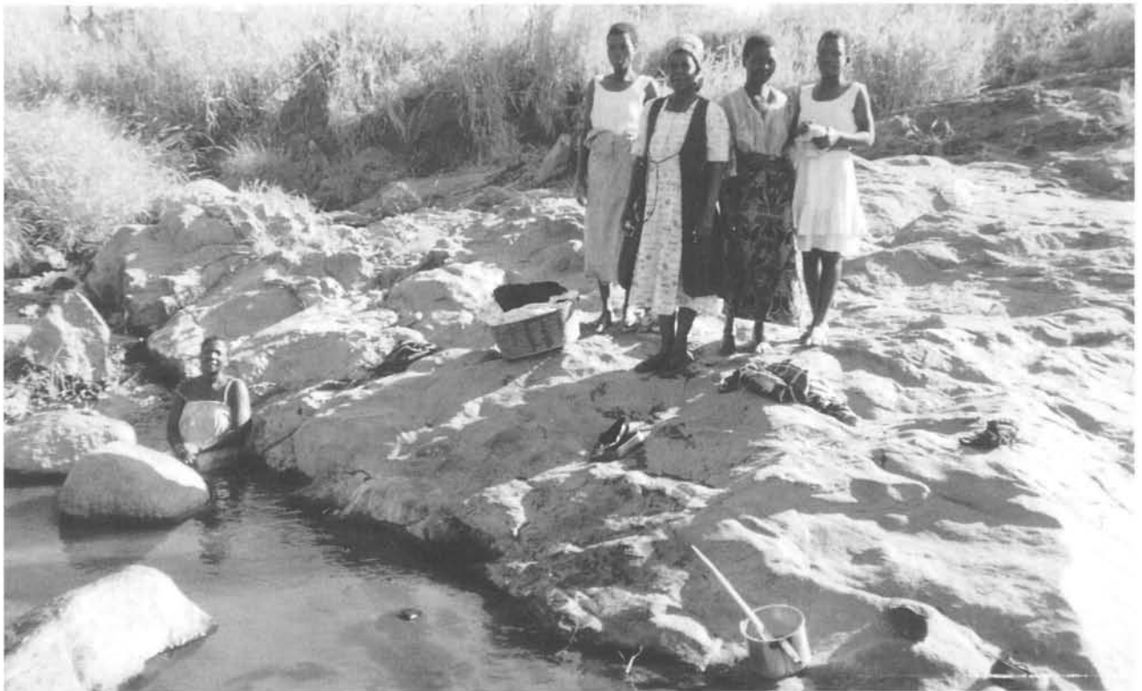
Women of Likhubula village near Blantyre, Malawi by the stream which provides washday water, bath water and drinking/cooking water. Note the washer women, the lady bathing and the water bucket.

By continued support concentrated in a selected area, we are confident that we can make a significant and lasting difference. This stimulating new development will focus on Malawi and will be known as THE AQUAID LIFELINE FUND